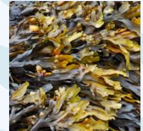
Bladder Wrack Seaweed