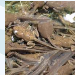
Tadpoles (with legs)