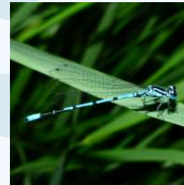
Common Blue Damselfly